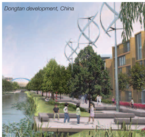
Dongtan development, China

Developers, designers, architects, planners, civil and site engineers, contractors, facilities managers – anyone employed in the built environment sector. This event could qualify for up to 6 hours of CPD.